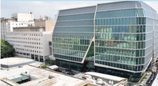
Halim and Aida Daniel Academic and Clinical Center (Daniel ACC)