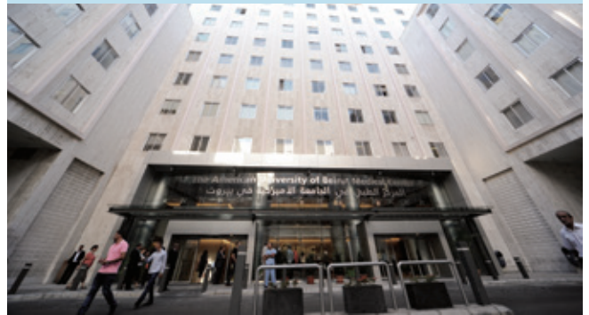
Medical Center Phase-2