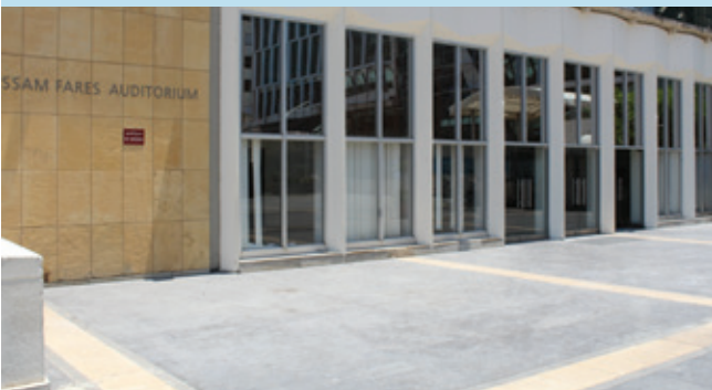
Issam Fares Lecture Hall