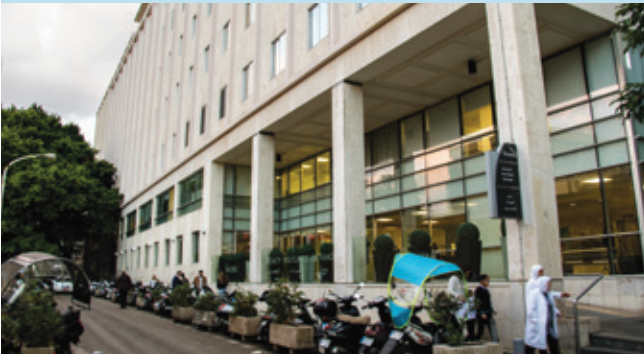
Medical Center Phase-1