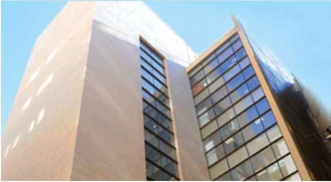
Medical Administration Building (MAB)