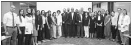
الحضور خلال الجلسة

تأسيس نظام تمويل الرعاية التلطيفية للمستشفيات التي تمتلك فريق عمل مؤهل لتأمين هذه الخدمات، حيث تشمل الرعاية التلطيفية داخل المستشفى والعلاج في المنزل. ناقش المشاركون خلال الحوار أربعة من عناصر السياسات المقترحة المستندة إلى الأدلة العلمية المذكورة في موجز السياسات والعنصر ١: دعم الرعاية التلطيفية داخل مؤسسات الرعاية الصحية. • العنصر ٢: توفير الرعاية التلطيفية في محل إقامة المرضى • العنصر ٣: تقوية التعليم وزيادة التدريب في مجال الرعاية التلطيفية بين المتخصصين في الرعاية الصحية • العنصر ٤: زيادة الوعي العام حول مفهوم الرعاية التلطيفية • العنصر ٥: وشهد المشاركون على ضرورة العمل وتوثيقه بأسرع من أجل الاستجابة لطلب المتزايد على الرعاية التلطيفية للمسنين، كبار الأطفال