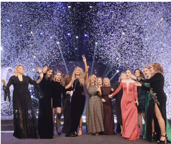
The Neonate fund committee during the Gala Dinner on January 24.

Thanks to Ms.Maya Diab, who made this Gala dinner another special one with her magical performance in support of the Neonate Fund!