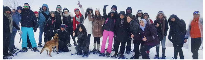
Faculty and residents during their snowshoeing hike in Baskinta

Residents and faculty embarked on a snowshoeing hiking trip on Saturday, February 9, 2019 to Baskinta. After a walk under the falling snow, the group went for a warm lunch in Hemlaya. The trip allowed our foreign residents to get to see one of our breathtaking natural scenes.