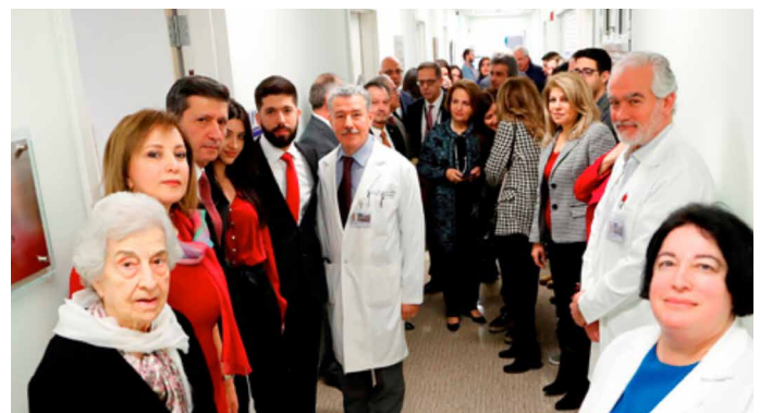
Faculty, staff, and family during the dedication ceremony on March 14.