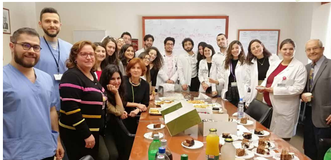
Third Year Medical students thanking the pediatric department, faculty, and staff on March 21 with a reception gathering.