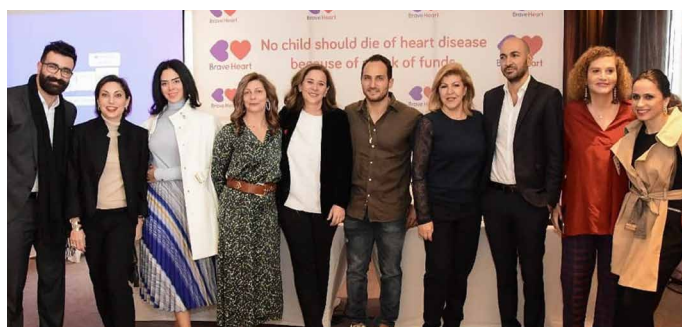
Brave Heart Fund committee, supporters, and ambassadors