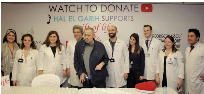
Singer Georges Wassouf with the Children's Heart Center team after the press conference

On Friday, January 11, 2019, the legendary music icon, Georges Wassouf, released his new hit song "Hal El Garih" in a press conference that was held in the Children's Heart Center (CHC) at the American University of Beirut Medical Center (AUBMC). During the event, he reiterated his support to the fund and offered to donate YouTube proceeds to the "Gift of Life Lebanon", an International NGO. In 2015, Wassouf was appointed as the ambassador of the NGO, and his step aimed at supporting the treatment of children with congenital heart disease at CHC. To watch the music video and help in raising funds, please click the following link: https://www.youtube.com/watch?v=flgsTsWLdJE