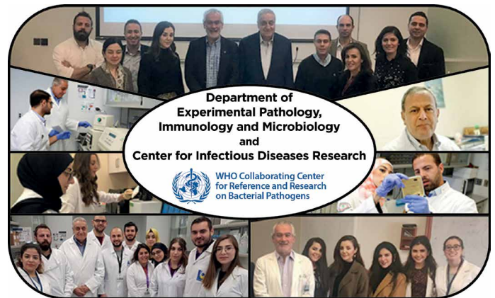
The CIDR and EPIM teams